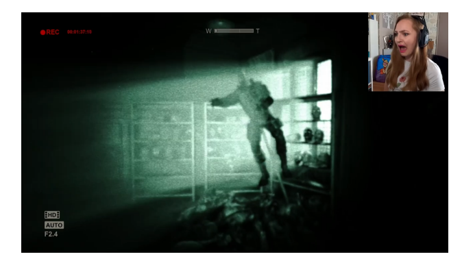
Fig. 1. One of the many jump scares of the Outlast Asylum Affect Corpus , depicting in-game visuals and face cam of YouTube user AnidaGaming. Image used with the streamer's permission.

This project has received funding from the European Union's Horizon 2020 programme (grant agreement No 951911).