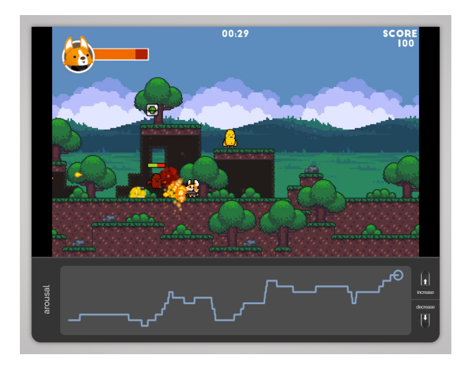
Fig. 3. Continuous, unbounded arousal annotation with the RankTrace method through PAGAN [7]. The figure shows the Run'N'Gun platformer game.

AGAIN offers continuous, unbounded arousal annotations of each gameplay session recorded with the PAGAN annotation tool [30] (see Figure 3). The interface shows the full history of the annotation process and does not limit the value range of the affect label. Due to these properties, the collected annotation trace preserves the subjective and ordinal nature of the player experience [8] and makes the dataset optimal for modelling through preference learning (see Section IV-A).