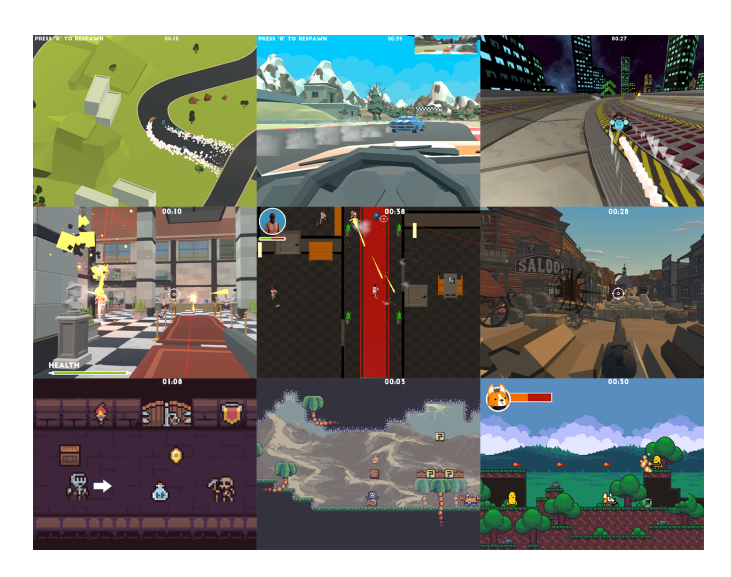
Fig. 2. The 9 games of the AGAIN dataset, one genre per row. Top row is racing games, mid row is shooter games and bottom row is platformer games.