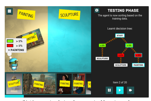
(b) AI agent simulating the supervised learning task