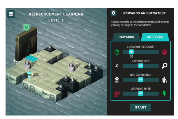
(a) Player setting up the reinforcement learning task

The game guides the player through these sets of actions, but also provides opportunities for exploration, experimentation, and reflection. Students are introduced to the learning content through a more open, constructivist approach. They are encouraged to explore, experiment, and construct their knowledge by observing the outcomes of their actions, evaluate the results, make and test their hypotheses. Through the design of the game we tried to avoid common stereotypes and address students' misconceptions of AI, such as the anthropomorphic nature of AI systems. We selected an unidentified object to represent the AI helper, so as to challenge the idea that AI only applies to robots, but that it may be applied to a variety of technology and computer systems. Players do have the option to choose and modify the appearance of their AI helper, including different models and colour variants; however, all models are fairly abstract and non-anthropomorphic. By setting the game in the context of cultural heritage (art objects) our aim was to address