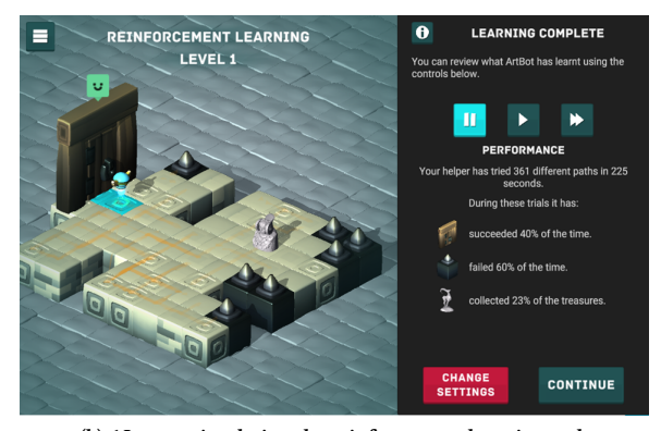
(b) AI agent simulating the reinforcement learning task

Figure 2: Screenshots of the second part of the "ArtBot" game: (a) The player defines the variables of the agent's reinforcement learning, (b) A final report is generated on the outcomes of the agent's pathfinding.